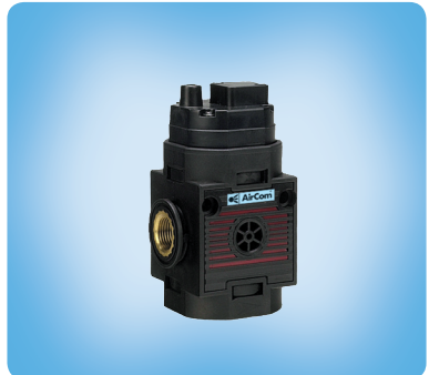
A0 soft start valve