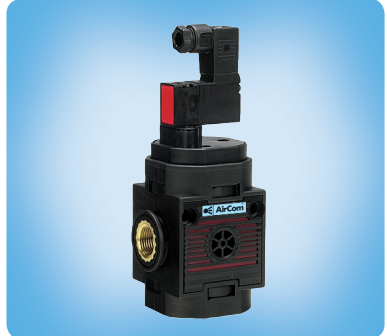
S0 electric switch-on valve