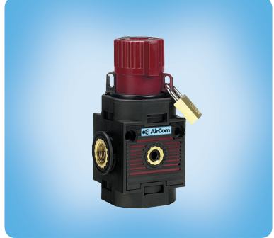
V0 manual switch-on valve